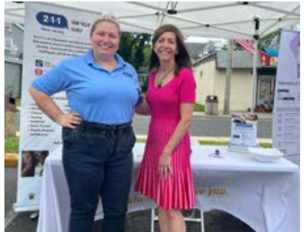
First Lady's Family Festival in Paulsboro