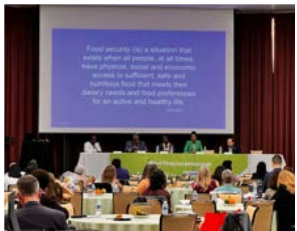
Rural Health Conference NJ Department of Health